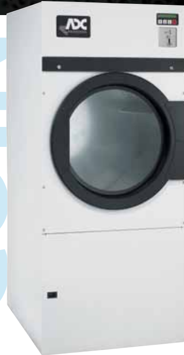
AD-24 Coin Dryer