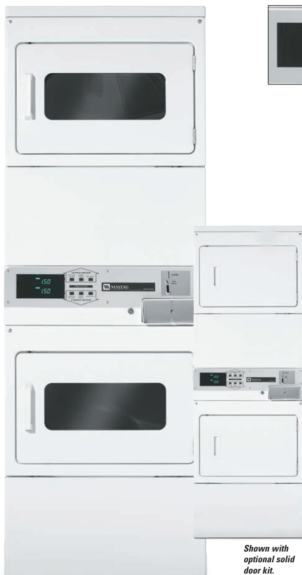
Shown with optional solid door kit.

Maximizing your equipment investment for over a half century.