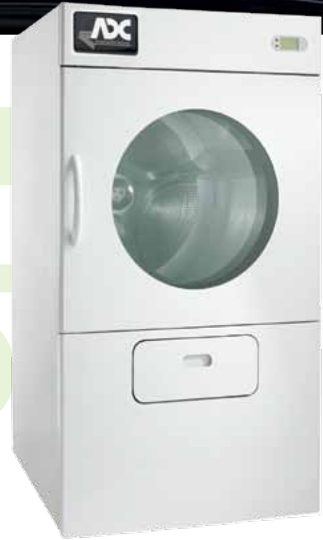
ES-50 OPL Dryer