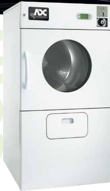
ES-76 Coin Dryer